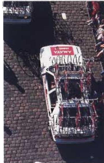
TOUR DE FRANCE.