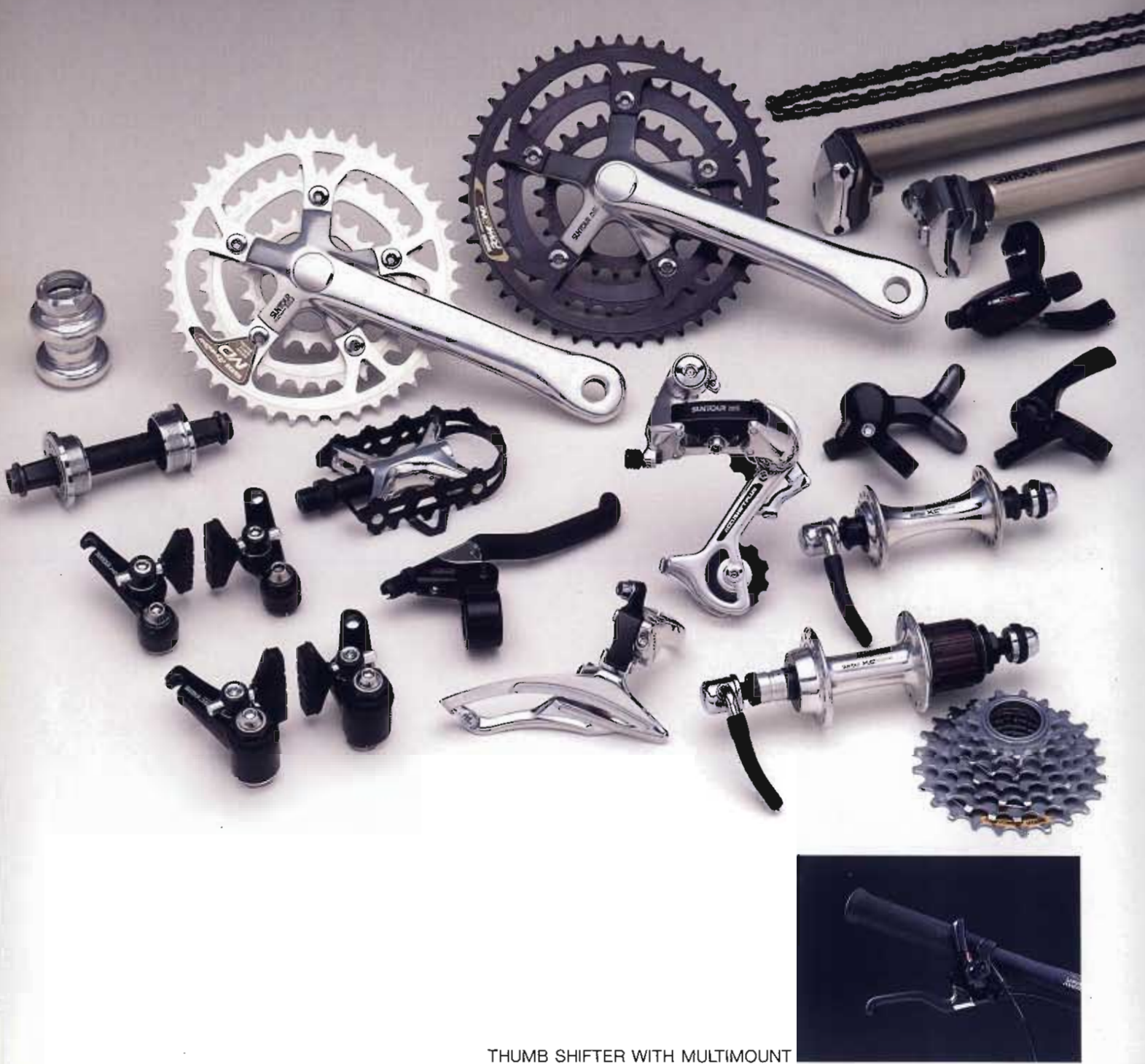
THUMB SHIFTER WITH MULTIMOUNT

MD POWERFLO WISHBONE SHIFTER SE X-PRESS POWERING