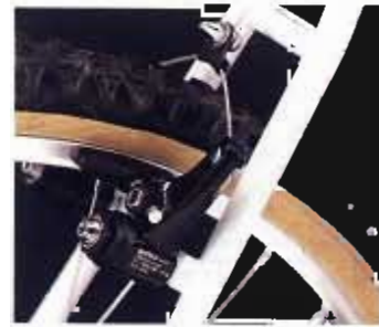
Shown here is a representative selection of this component. The specifications of other products are also listed.

Model: SP-XP10 (Code No. 53639921) 29.8mm/L=300mm (Code No. 53639931) 30.2mm/L=300mm Specifications ● Diameter: 29.8mm, 30.2mm ● Saddle angle adjustment range: 21-degrees ● Saddle rail diameter: 7~8mm ● Weight: 279g (29.8mm/L=300mm)