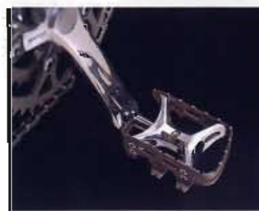
11 Shown here is a representative selection of this component. The specifications of other products are also listed.

The new XC-Pro pedal has been refined and upgraded for easier foot placement and pedalling. (adapted Grease Guard System.)