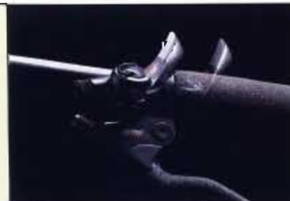
THUMB SHIFTER WITH MULTIMOUNT