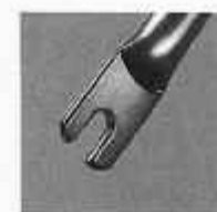
113-1 (Stamped Tip Ends)

Light Weight Fork Crown: AS-13 Hi-Tension Butted Stem Hi-Tension Blades (23.0 x 1.2) With Stamped Tip Ends (113-1), MA Solid Ends (113-2) or TF-R 1213, TF 1210 Ends (113-3) C.P. Finish or Raw Option BS-13 Crown with TANGE Mark